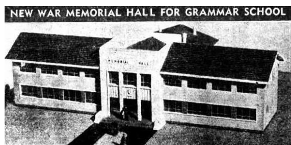
'Proposed Memorial Science Building, Guildford Grammar School' (1947 RAIA WA Exhibition Catalogue, p.25); and model of War Memorial Hall and Science Block for Guildford Grammar School ( The West Australian , 6 November 1954, p.10).